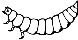
Fig. 5. Fullgrown larva of Lomechusa strumosa . (Magnified.)

The same adoption instinct occurs also with birds, although not so seemingly intelligent as with ants. The best-known example is the hen, that readily hatches eggs of other hens, ducks, geese, turkeys, etc., and extends to all her adopted children the same "motherly care," she would show to her own chicks. G. Romanes 1 succeeded even in making a hen the foster-mother of some young ferrets, which he had substituted for the artificial eggs, on which she was hatching. The numerous species of birds, which tend the young cuckoos, follow the same line of conduct, the only difference being, that they lavish still greater care on these changelings, because they open their mouths wider in crying for food than their own nestlings. The adoption instinct, finally, is met with among mammals, the most blood-thirsty carnivores not excepted. Though it is a fable, that ancient Rome